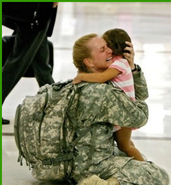
Give Thanks for our Troops!

Thank you for your continual friendship and support and thank you for helping us reach families, one woman at a time.